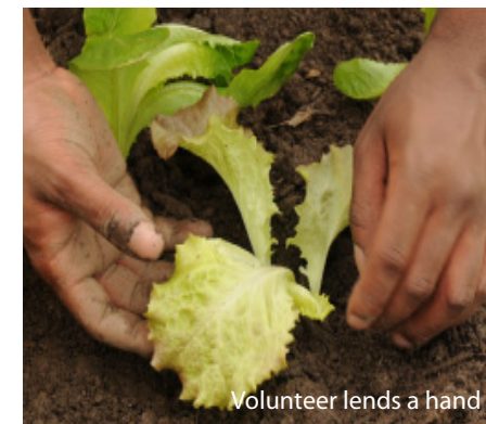
Volunteer lends a hand

People's Gardens promote sustainable practices. They improve water quality, improve soil health and create shelter and nesting habitat for wildlife.