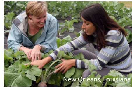
New Orleans, Louisiana

The garden must be a collaborative effort between other volunteers, neighbors or organizations within your community. Consider forming local partnerships to carry out the mission of a People's Garden.