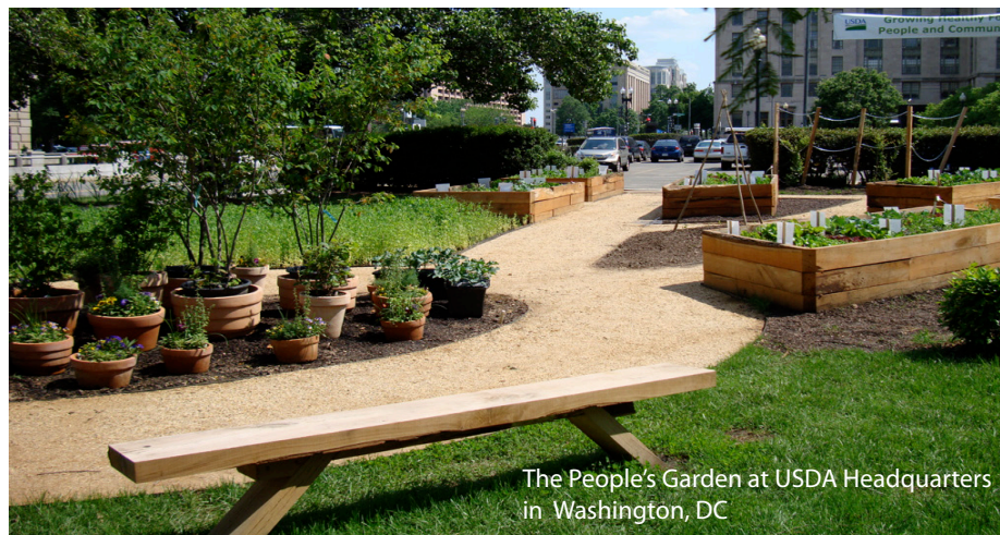
The People's Garden at USDA Headquarters in Washington, DC

With each garden we plant and every sustainable practice we implement, USDA will demonstrate how easy it is to green our communities, take better care of our natural resources, and produce healthy fruits and vegetables.