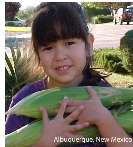
Albuquerque, New Mexico

When Abraham Lincoln founded USDA in 1862, he referred to it as "The People's Department." It is a description that is as true today as it was then. USDA touches the lives of Americans every day. To commemorate this significant link to all Americans, Secretary of Agriculture Tom Vilsack, broke ground on the first People's Garden at USDA Headquarters on February 12, 2009, the bicentennial of Lincoln's birthday. Today, the entire grounds are a part of this garden. Plans are being developed to create rooftop and rain gardens and incorporate pollinator, wildlife, and edible components throughout the landscape. The garden at USDA headquarters, as well as gardens at all USDA facilities, will demonstrate sustainable conservation practices and will be used to educate and engage the public.